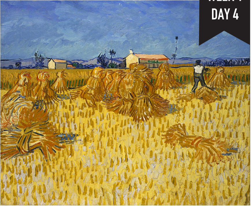
'Harvest in Provence' by Vincent van Gogh