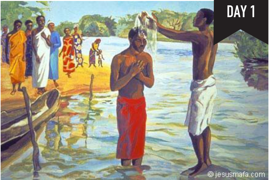
Jesus Mafa, "The Baptism of Christ," 1973, Nigeria